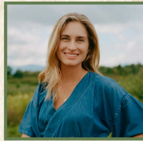
Lauren Bush Lauren Fashion model, designer, and CEO