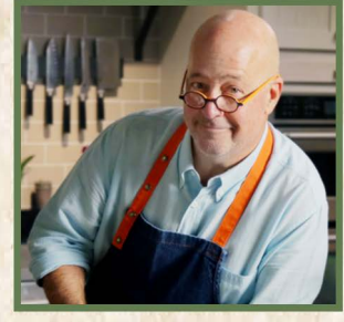
Andrew Zimmern Chef, restaurateur, and television personality