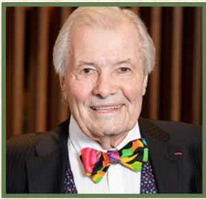
Jacques Pepin Chef, artist, and New York Times columnist