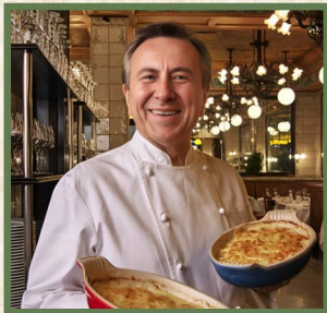
Daniel Boulud Chef, philanthropist, and restaurateur