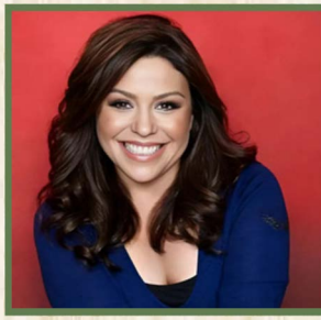
Rachael Ray Chef, author, and television personality