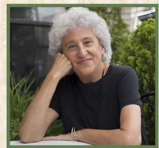
Marion Nestle Professor and public health advocate