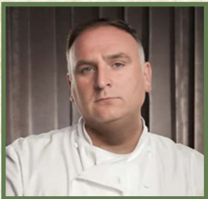
Jose Andres Chef and restaurateur