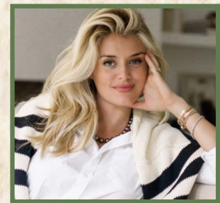
Daphne Oz Television host, food writer, and chef