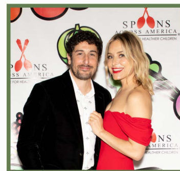
Jason Biggs & Jenny Mollen