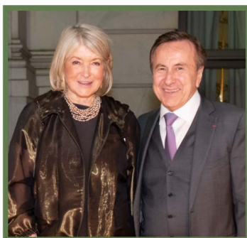
Martha Stewart & Daniel Boulud