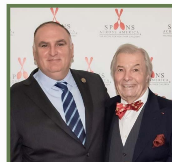
José Andrés & Jacques Pépin